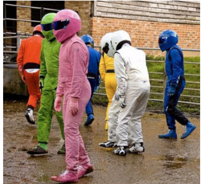
Chair farming...the future of OUSGG