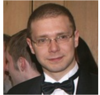
Our dapper chair

Well, we've made it. Michaelmas is now over, and we've survived it with out any fatalities or even a serious maiming. I'll have to try harder next time. I hope everyone's enjoyed the meetings this term. For those of you who couldn't make the meetings since the last issue of PostScript, we've been bouldering at Oxford Brookes, had an African Music workshop, and built a car entirely out of cake in homage to the Skoda advert.