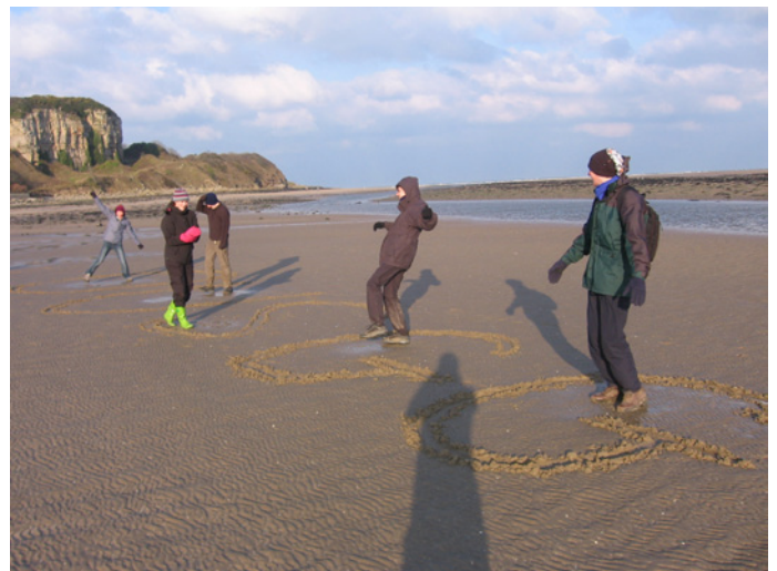
On the beach in Anglesey (07/08)

Leisurely walks up that local hill to enjoy fine views but back in time for hot chocolate and cake is what relaxing walking should be about.