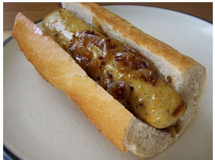
How it should be done

6. If in doubt, ask for advice from a more experienced sandwich maker who will be more than happy to dispense constructive criticism and direction.