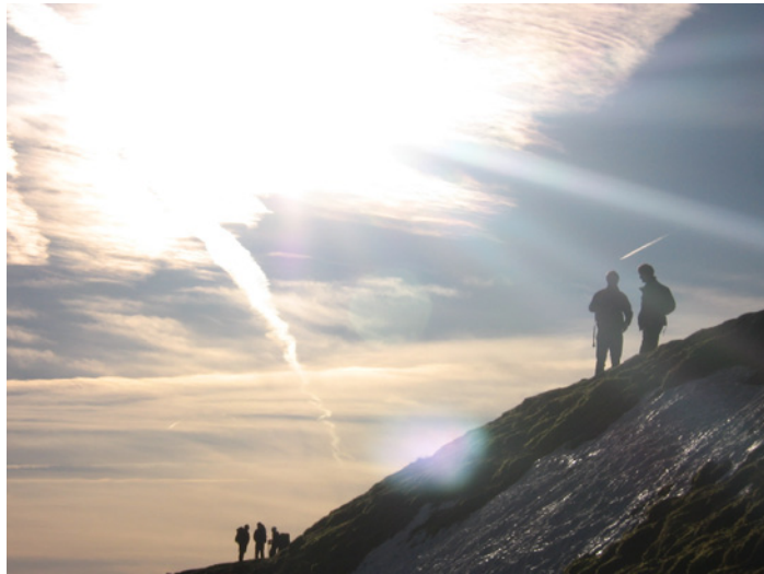
Above a temperature inversion on Hellvellyn (08/09)