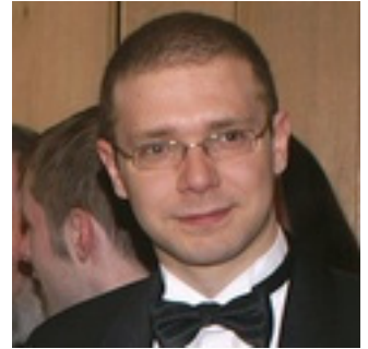
Our dapper chair

Since the last issue of PostScript, we've ran around Oxford playing a Wide Game, we've failed miserably at solving a murder and saving the world in our Murder Mystery evening, we've seen Oxford United beat Northampton 3-1, and we broke with tradition and survived the Fireworks evening without hitting anyone with a rogue firework.