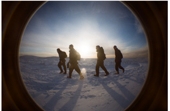
In the peak district in metres of snow (09/10)

An entire week of days spent on the hill, summiting the most exciting mountains in the UK, in glorious cool crisp weather (sometimes), followed by a pint or two of English ale.