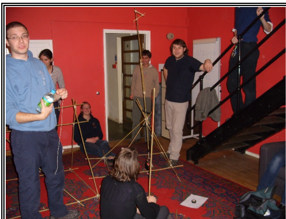
So I lied. This random image is some of the 'Trebuchets' from 1 st week indoor pioneering.