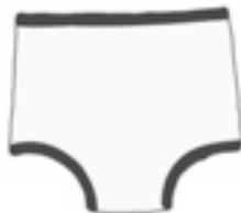
Summer Trip Fun!