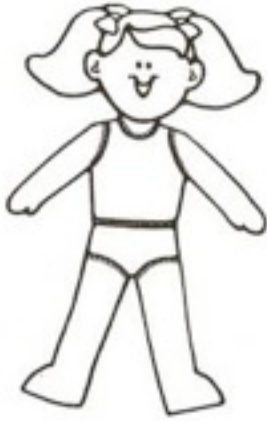
Pin the bruise on Shell!