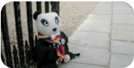
Adventures of Erik