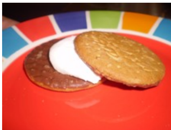
Figure 2: Marshmallow as observed after 7 seconds.

marshmallows at gooeyness stage three whereas others enjoy mallow which have reached stage four and must be consumed using a spoon.