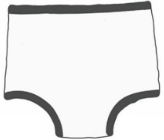
Decorate your pants!