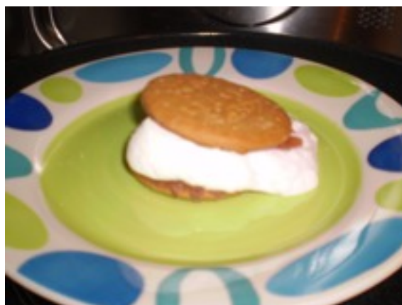
Figure 3: Marshmallow as observed after 10 seconds.