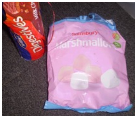
Figure 1: Scientific Materials

The study was performed under conditions two weeks apart resulting in a recorded increase in staleness during this time.